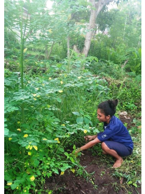
Fince bij de Moringa Oleifera